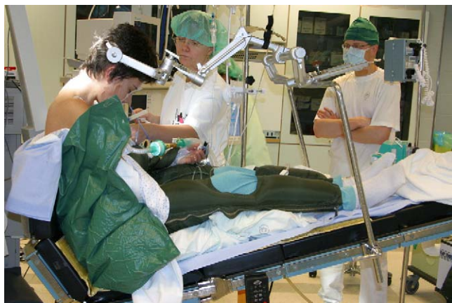
Fig. 5. Senior anesthesiologist supervising the positioning of the patient.

The patient's head is positioned 20 cm or even more above the heart level (Fig. 4) to reduce venous bleeding in the operative field, and the neck is in a neutral position to ensure free venous return. Head position is tailored according to aneurysm location, direction, and morphology (Fig. 5). The head is fixed with a Sugita frame by the senior neurosurgeon in our service; we do not administer local