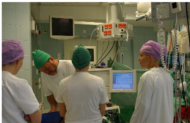
Fig. 3. Automatic anesthesia data collection.