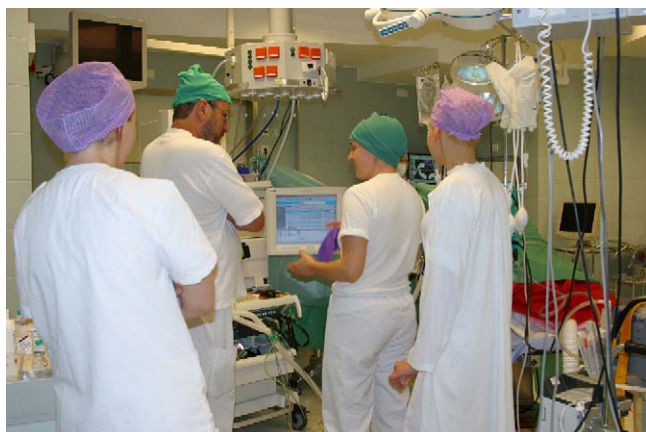
Fig. 1. The neuroanesthesia team: senior anesthesiologist discussing the case with the resident and the anesthesia nurse.

Fentanyl in 0.1-mg boluses or an infusion of remifentanyl is recommended for analgesia. It is notable that remifentanyl has a marked hypotensive effect, and it can be