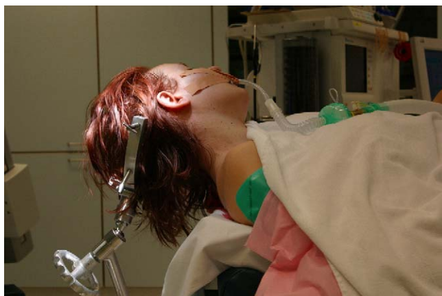
Fig. 4. Positioning of patient head high above the heart.

given in 0.05- to 0.15-mg boluses to control hypertension or to prevent sudden increases of arterial blood pressure as a response to painful stimuli, such as the application of the pins of the head holder. Fentanyl is preferred in patients who are likely to need controlled ventilation postoperatively, and remifentanyl in those who will be awakened after surgery. The first 1-g bolus of acetaminophen should be infused well before the end of surgery. NSAIDs including COX-2 selective drugs are not recommended during the acute phase [14]. Muscle relaxants are again at the discretion of the anesthesiologist (Fig. 3).