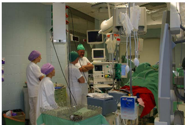
Fig. 2. General view of the anesthesia working station.

Before the induction of anesthesia we recommend glycopyrrolate 0.2 mg intravenously. Thereafter, fentanyl, in a dose sufficient to prevent the hemodynamic response to laryngoscopy and intubation, is given (5–7 \mu\text{g}/\text{kg} ) [18]. For